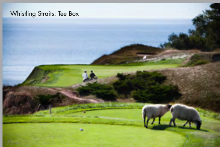
Whistling Straits: Tee Box