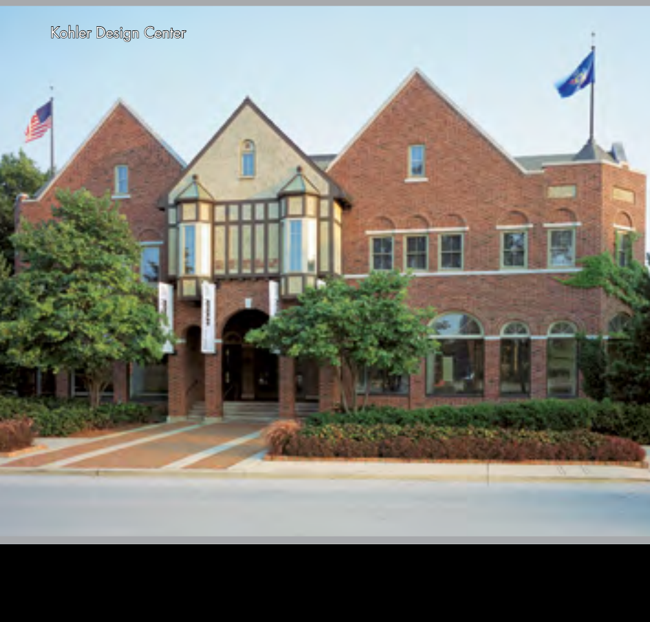
Kohler Design Center

Our memories of the 2010 PGA Championship are probably about a gambler taking a risk on the third playoff hole, and a club grounding that cost a young gun his first major. The answer to the inevitable trivia question will be ‘a man named Bubba’ and ‘a kid named Dustin,’ but the eventual champion in 2010 was Martin Kaymer. Kaymer played brilliantly and hoisted the Wanamaker trophy for his first major championship.